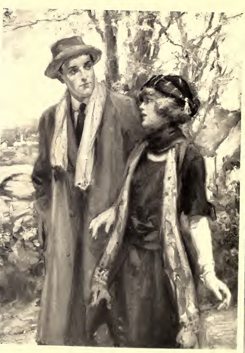
"I'm sorry," Tabs apologized. "I didn't mean anything unkind."